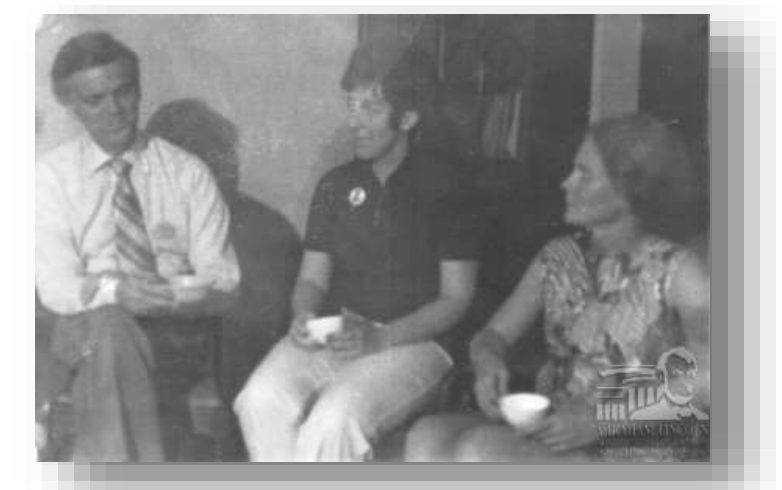
This picture was taken in the summer of 1971, in Hyde Park, during Dan Walker's run for governor.