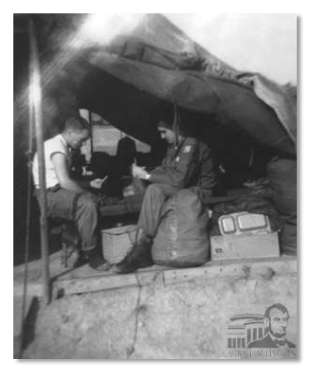
Ivan Maras and a buddy relax from their duties over a card game a few miles behind the front lines in 1953.