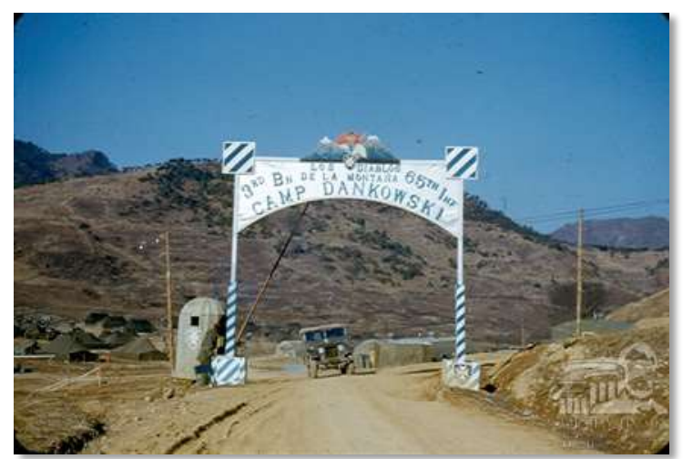
The entrance to Camp Dankowski, the 65th Infantry Regiment's home away from home in South Korea in the fall of 1953.