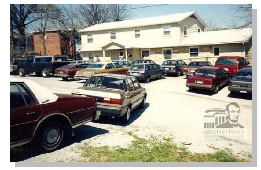
This building became the second home for the Carbondale Women's Center.