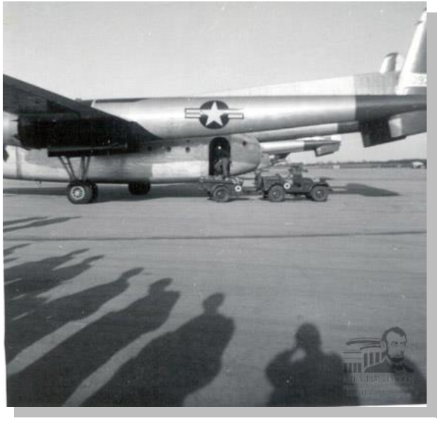
A C-119 "Flying Boxcar" awaits Zemaitis and fellow paratroopers for their upcoming jump in 1957.