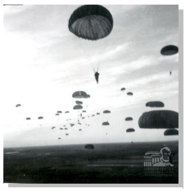
Zemaitis and fellow paratroopers are finally 'airborne,' drifting to the ground during their jump at Fort Campbell,